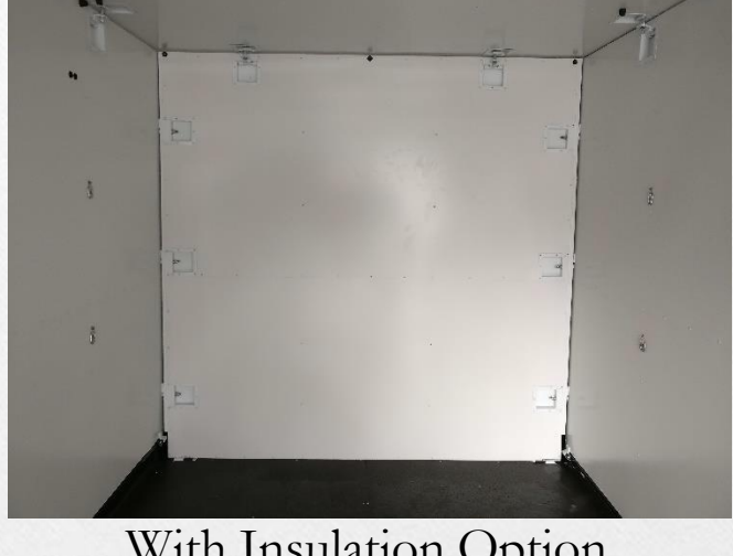
With Insulation Option