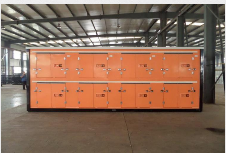
16 space (8 on each side) Locker-Box™