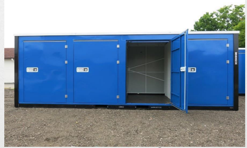
4 space GreenLite® Box16